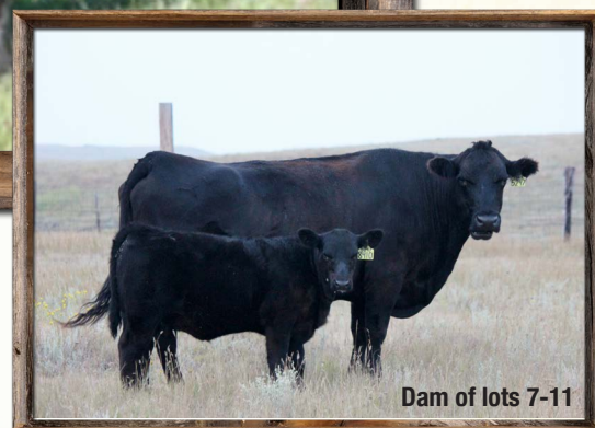
Dam of lots 7-11

Connealy Earnan 076E Ellingson Roughrider 4202 EA Blackclass 8914